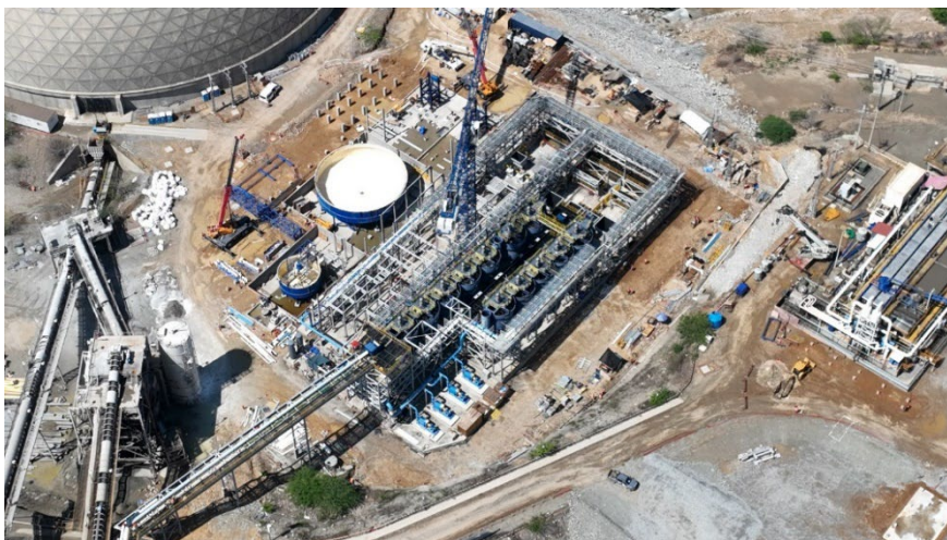
Figure 2: Construction activities at the flotation area, including the flotation tanks, thickeners, and regrind mills

Steel erection at the paste plant began at the end of May and the plant is expected to be completed in Q1 2025 given paste plant commissioning is sequenced to occur after the process plant infrastructure is commissioned. Progress was made on the binder silo and tailings thickener adjacent to the filter building (Figure 3).