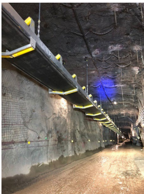
Figure 1: Installation of the Guajes conveyor belt has commenced following installation of conveyor tables

Significant progress has been made with the installation of the Guajes conveyor. The majority of the conveyor belt tables are now installed and aligned, and the belt has begun to be fed onto the conveyor. Commissioning of the conveyor is expected to begin in late Q3 (Figure 1).